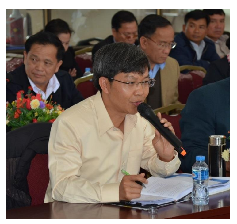
Provincial Government representative at the meeting in Oudomxay on March 3^{\rm rd} , 2016