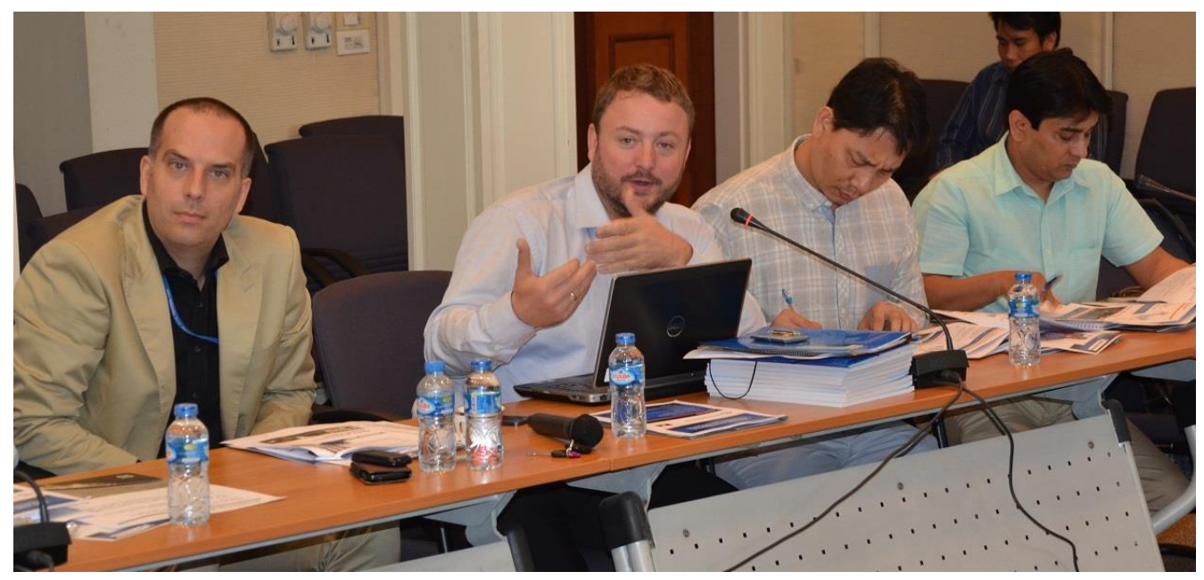
Development Partner's meeting in Vientiane on February 26<sup>th</sup>, 2016