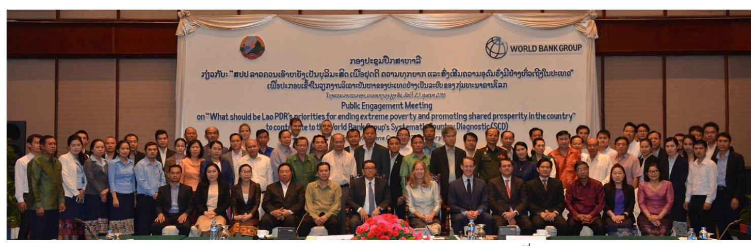
Participants to the Central Government engagement meeting held in Vientiane on February 23<sup>rd</sup>, 2016

From February 23<sup>rd</sup> to March 9<sup>th</sup>, 2016, the World Bank Group (WBG) carried out public engagement meetings with diverse stakeholder groups present in the country (State and Provincial Governments, National Assembly, Mass Organizations, Private Sector, Development Partners, Civil Society and Academics). The engagement meetings included 8 events in 4 locations (Vientiane, Luang Prabang, Oudomxay and Pakse) and focused on identifying and prioritizing the key development opportunities to end extreme poverty and promote shared prosperity in Lao PDR. The engagement aimed at gathering recommendations on the content and priorities within the Systematic Country Diagnostic (SCD) and to feed into the final version of the document. The public engagement also sought to increase understanding within the WBG of the concerns and priorities on the situation of Lao PDR as well as to strengthen relationships with key stakeholder groups.